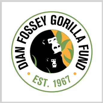
Dian Fossey Gorilla Fund