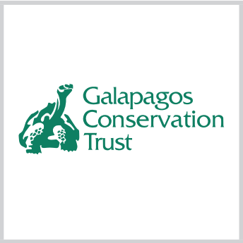
Galapagos Conservation Trust