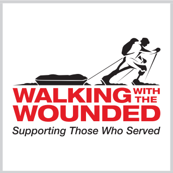
Walking With The Wounded