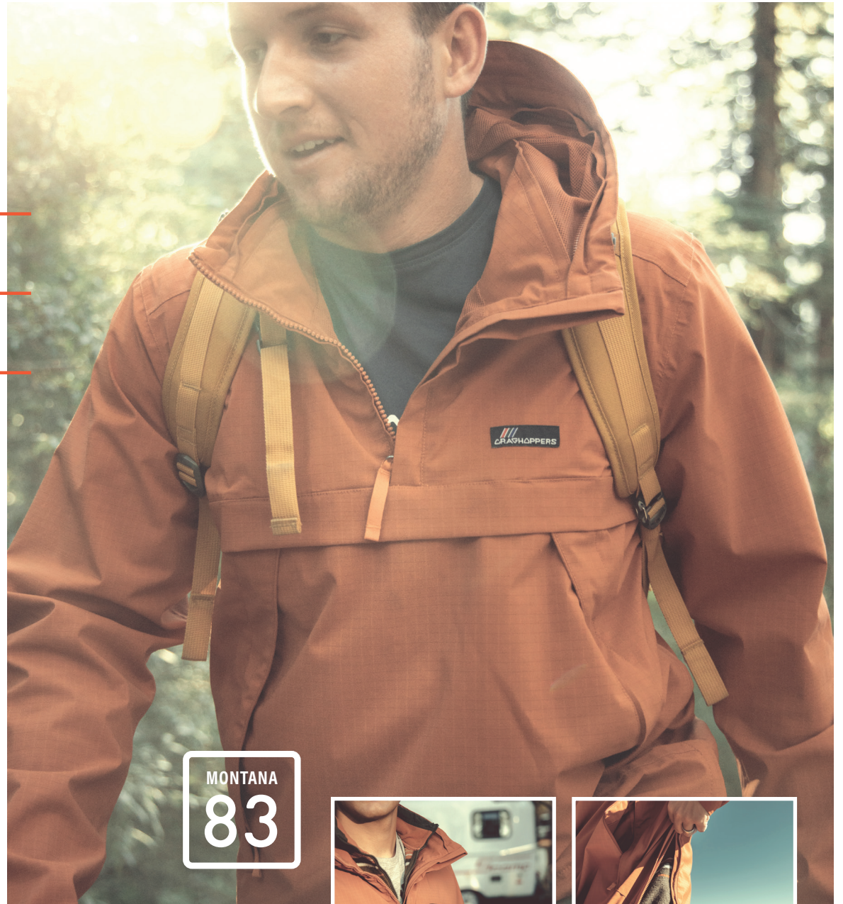
Anderson Cagoule Potters Clay