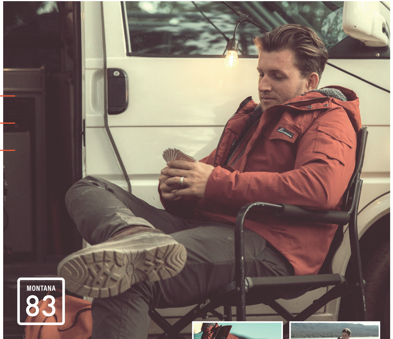
Kody Jacket Auburn