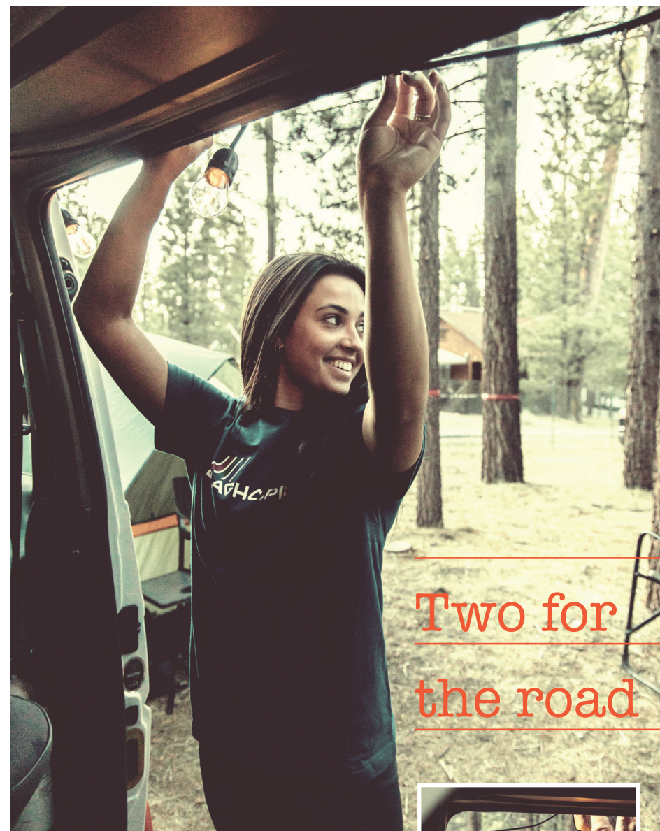
Lowood Short Sleeved T-shirt True Teal