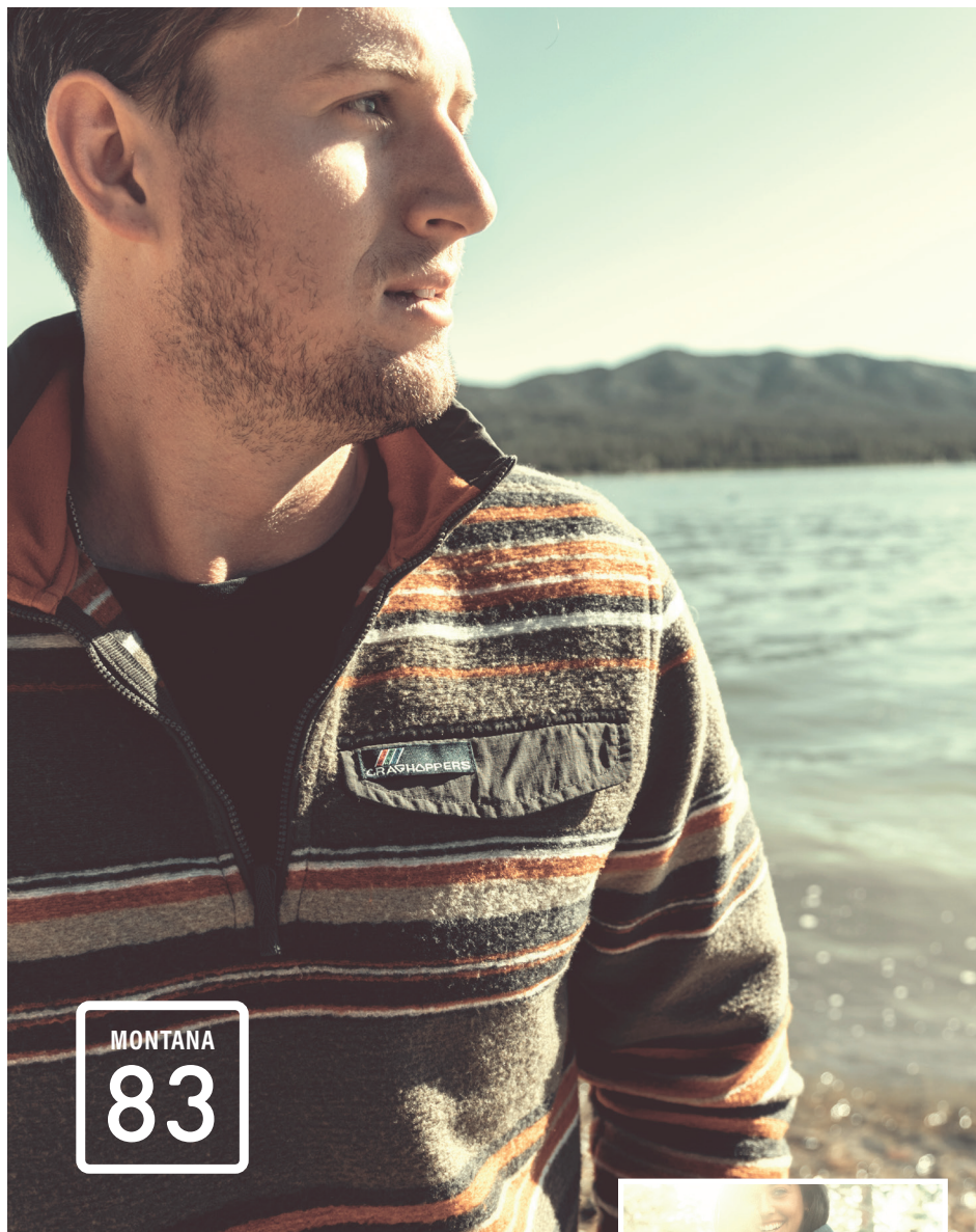
Lionel Half Zip Dark Moss Stripe