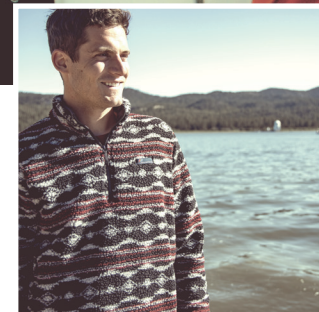
Sawrey Half Zip Black Pepper Print

Good company makes a journey seem shorter